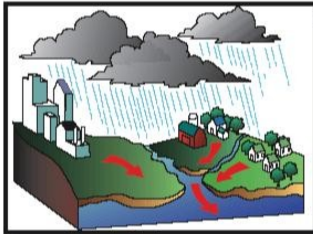
Drainage Areas and Surface Runoff

Calculation of peak storm water runoff rate from a drainage area is often done with the Rational Method equation ( Q = CiA ). Use of Excel spreadsheets for calculations with this equation and for determination of the design rainfall intensity and the time of concentration of the drainage area, are included in this course. The parameters in the equations are defined with typical units for both U.S. and S.I. units.