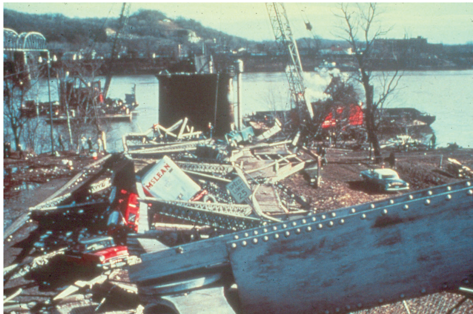
Figure 1.1.1 Collapse of the Silver Bridge

During the bridge construction boom of the 1950's and 1960's, little emphasis was placed on safety inspection and maintenance of bridges. This changed when the 681 m (2,235-foot) Silver Bridge, at Point Pleasant, West Virginia, collapsed into the Ohio River on December 15, 1967, killing 46 people (see Figure 1.1.1).