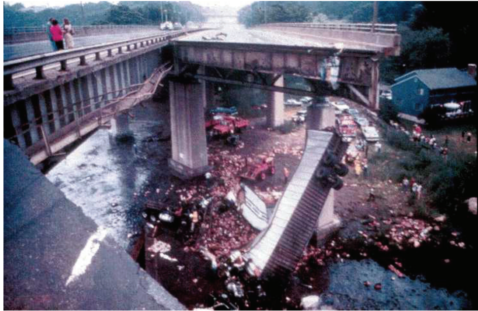
Figure 1.2.1 Mianus Bridge Failure