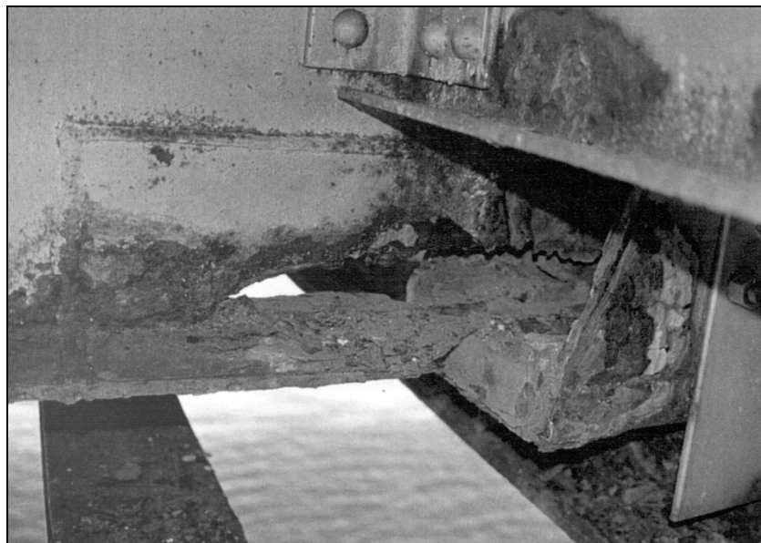
Exhibit IX. 1 Structure with Lead Paint

A number of states are experiencing difficulty in removing lead based paints on deteriorating structures as shown in Exhibit IX.1. The cost of removal operations has increased in response to recent legislation and requirements for containment and disposal of waste containing lead, as well as worker safety. Several issues have emerged, all relating to lead-based paint removal. Maintaining worker safety and minimizing exposure to lead are of paramount importance during maintenance activities. These issues are addressed in Session X-B: Toxic Materials. Lead-based paint removal methods that meet current regulatory requirements have become expensive and are still developing. These methods are covered in Session XIII-E: Spot Painting. A third issue, discussed in this session, is the containment and disposal of the removed lead-based paint material.