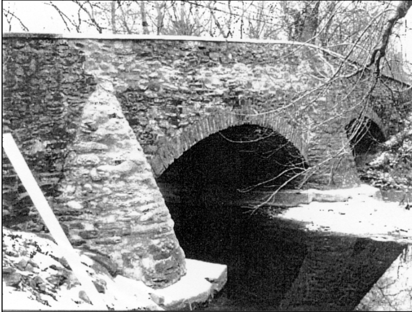
Exhibit IX. 4 Historic Masonry Arch Bridge

structure will not be impacted. If rehabilitation is proposed for an historic bridge, the process is guided by the Secretary of the Interior's Standards for Rehabilitation (available on the Internet at http://www2.cr.nps.gov/tps/secstan1.htm ).