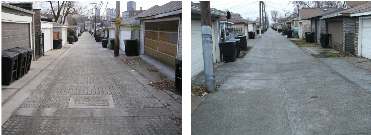
Figure 10: Permeable Pavers and Permeable Concrete Chicago Alleys

In 2006, when the Green Alley Program began, the city paid about $145 per cubic yard of permeable concrete. Just one year later, the cost of permeable concrete had dropped to only $45 per cubic yard. Compared with the cost of ordinary concrete, $50 per cubic yard, permeable concrete may have seemed like an infeasible option in the past to customers wanting to purchase concrete. 31 After the city's initial investment in the local permeable concrete market, the product cost has come down making permeable concrete a more affordable option for other consumers besides the city. This has resulted in an increased application of permeable concrete throughout the region.