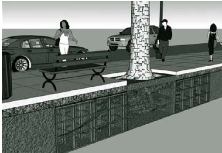
Figure 6. Silva cell structures support the sidewalk while providing root space for street trees (Source: Deep Root Partners, LP).