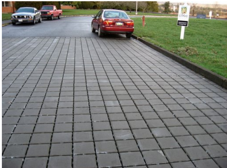
Figure 3. Pervious pavers used in the roadway of a neighborhood development in Wilsonville, OR.

The two typical maintenance activities are periodic sweeping and vacuuming. The City of Olympia, WA has experimented with several methods of clearing debris from permeable concrete sidewalks. Each of the methods was evaluated on the ease of use, debris removal, and the performance pace. The cost analysis by Olympia, WA found that the maintenance cost for pervious pavement was still lower than the traditional pavement when the cost of stormwater management was considered.