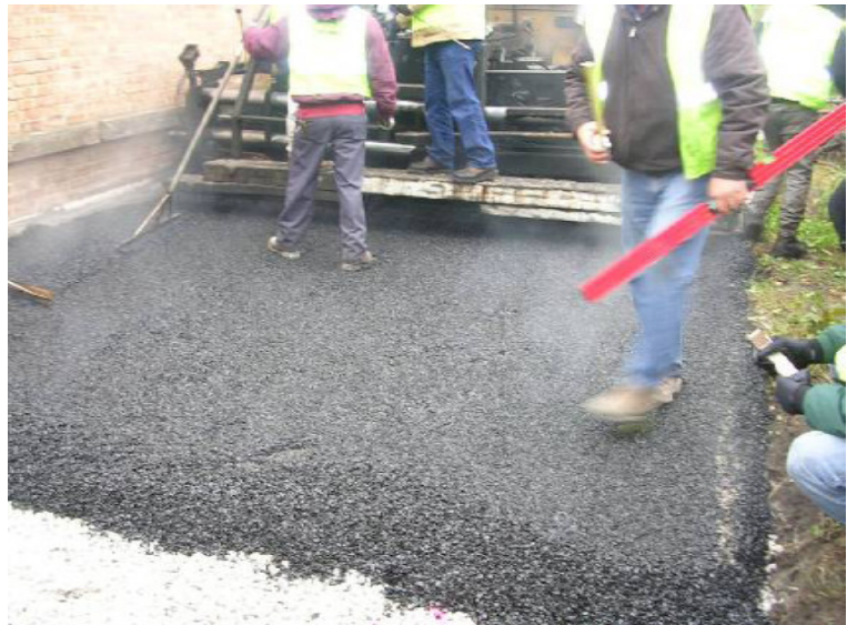
Figure 9: Permeable Asphalt Installation Using Ground Tire Rubber.

Four design approaches were created using these techniques. Based on the local conditions, the most appropriate approach is selected. In areas where soils are well-draining, permeable pavement is used. In areas where buildings come right up to the edge of pavement and infiltrated water could threaten foundations, impermeable pavement strips are used on the outside with a permeable pavement strip down the middle. In areas where soils do not provide much infiltration capacity, the alley is regraded to drain properly and impermeable pavement made with recycled materials is used. Another approach utilizes an infiltration trench down the middle of the alley. Light colored (high albedo) pavement, recycled materials, and energy efficient, glare reducing lights are a part of each design approach.