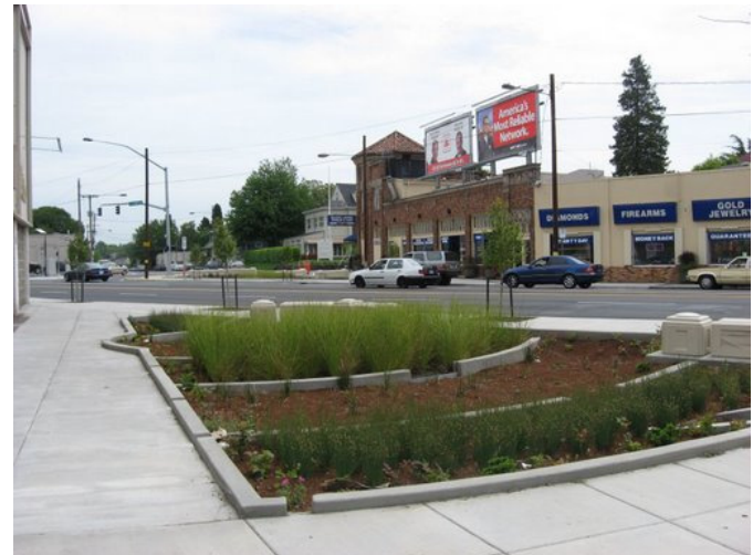
Figure 2. This bioretention area takes runoff from the street through a trench drain in the sidewalk as well as runoff from the sidewalk through curb cuts

A few municipal DOT programs have instituted green street requirements in roadway projects, but as of yet, specifications for street bioretention have not yet been incorporated into municipal DOT specifications. Many cities do have street bioretention pilot projects; two of the well documented programs are noted in the table. Several concerns and considerations have prevented standard implementation of bioretention by DOTs.