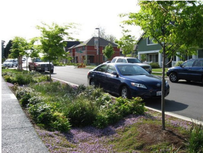
Figure 1. The street-side swale and adjacent porous concrete sidewalk are located in the High Point neighborhood of Seattle, WA.

The Transportation Growth and Management Program of Oregon, through a Stakeholder Design Team, developed a guide for reducing street widths titled the Neighborhood Street Design Guidelines . 6 The document provides a helpful framework for cities to conduct an inclusive review of street design profiles with the goal of reducing widths. Solutions for accommodating emergency vehicles while minimizing street widths are described in the document. They include alternative street parking configurations, vehicle pullout space, connected street networks, prohibiting parking near intersections, and smaller block lengths.