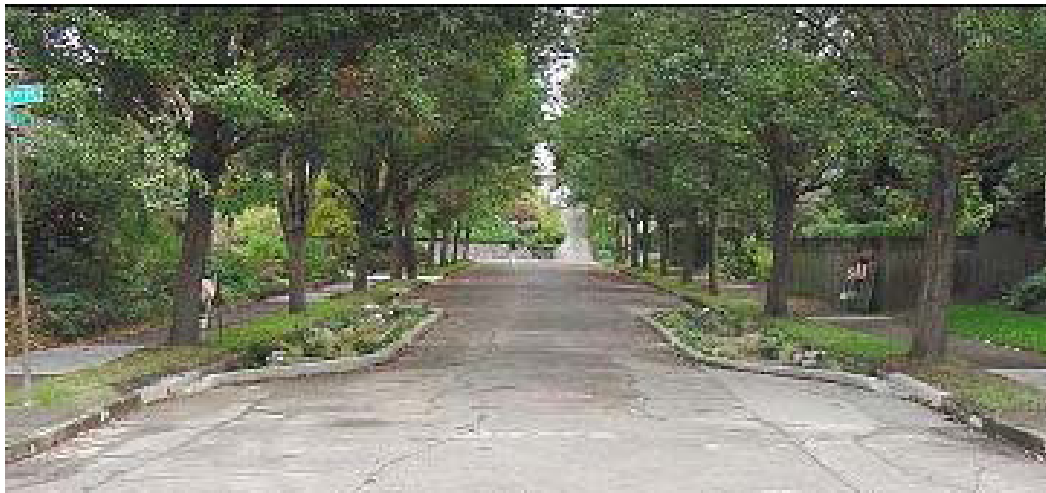
Figure 8: NE Siskiyou Vegetated Curb Extensions