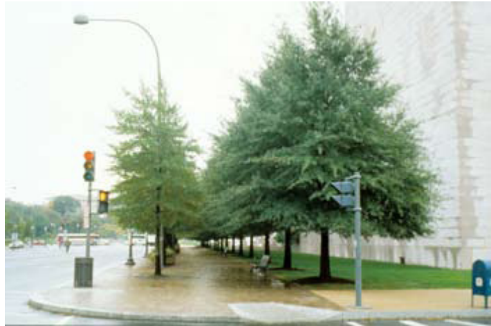
Figure 4. Trees planted at the same time but with different soil volumes, Washington DC

By providing adequate soil volume and a good soil mixture, the benefits obtained from a street tree multiply. To obtain a healthy soil volume, trees can simply be provided larger tree boxes, or structural soils, root paths, or “silva cells” can be used under sidewalks or other paved areas to expand root zones. These allow tree roots the space they need to grow to full size. This increases the health of the tree and provides the benefits of a mature sized tree, such as shade and air quality benefits, sooner than a tree with confined root space.