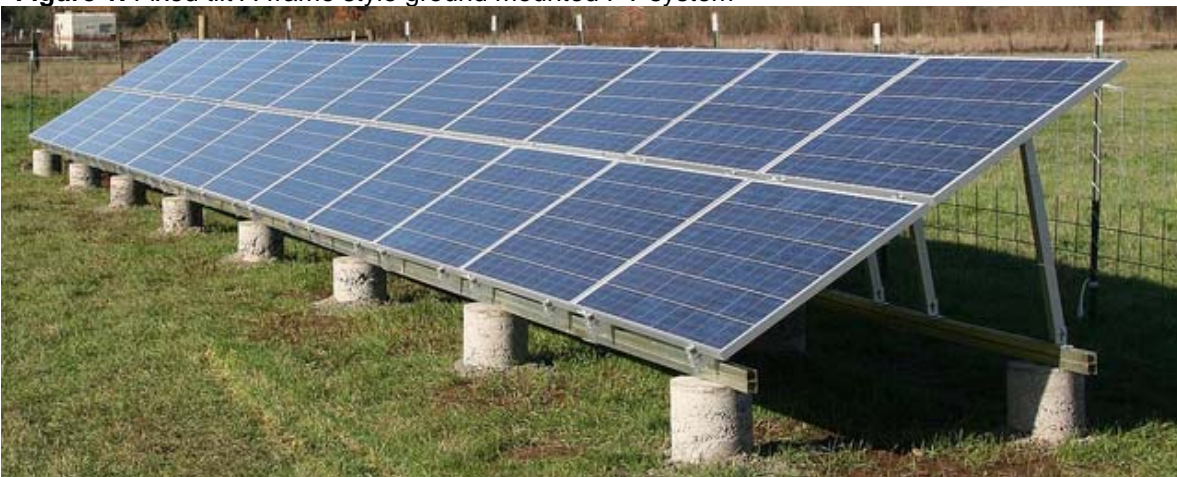
Figure 1. Fixed tilt A-frame style ground mounted PV system

In Figure 1 , the aluminum support stanchions supporting the PV panels can be seen on the right. The aluminum stanchions are secured to pillar-shaped ground penetrating concrete footings in the front and rear. The preceding discussion is relevant to PV solar systems. Comparison of PV systems to alternate solar technologies is discussed in further detail in the following section.