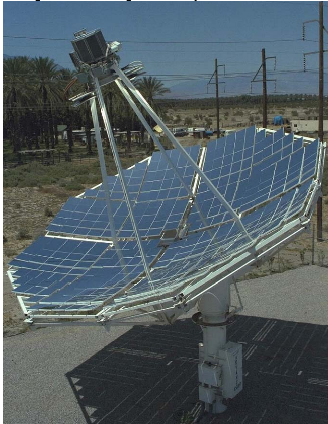
Figure 6. Dish/engine solar system