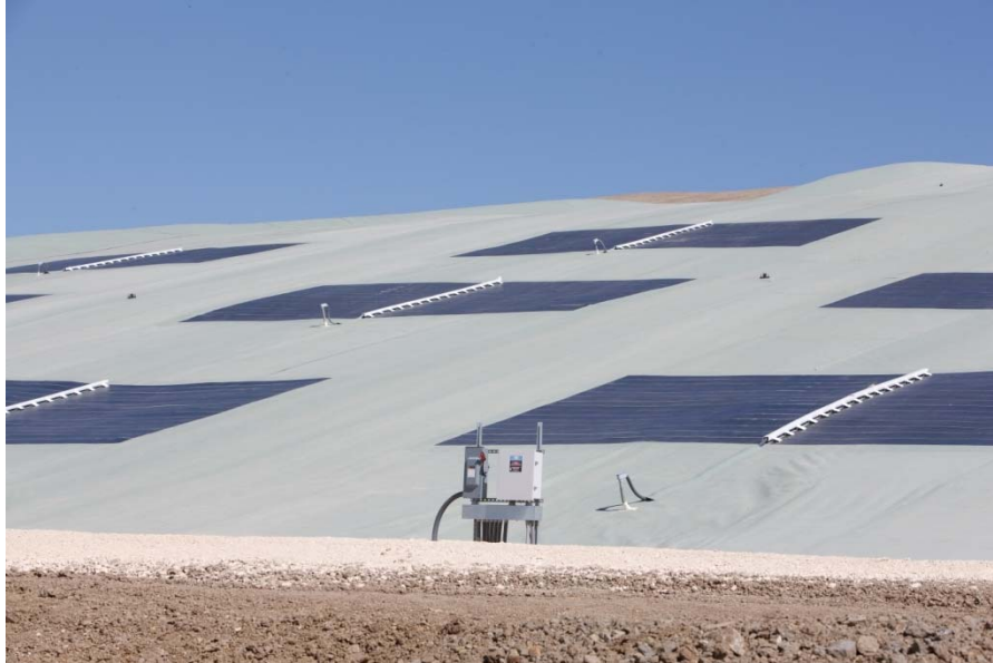
Figure 7. Flexible PV laminates on the Tessman Road Landfill near San Antonio, TX