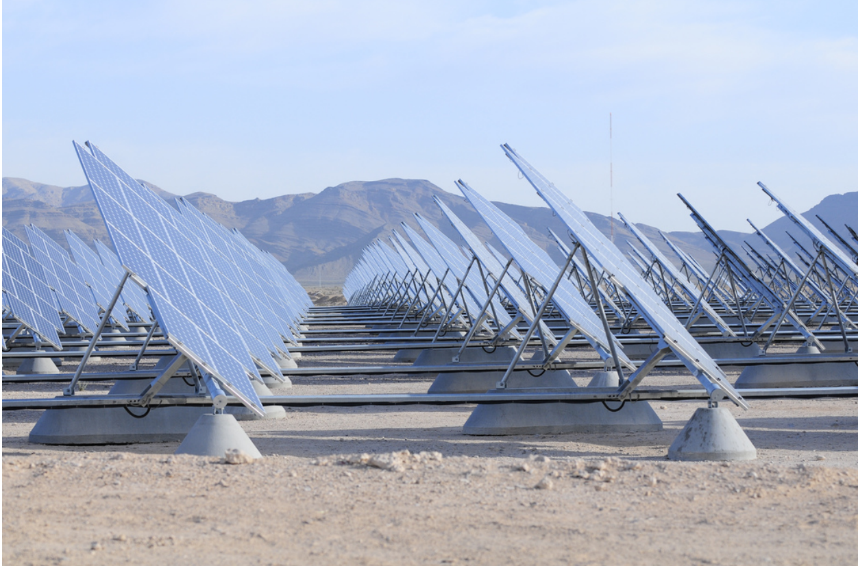
Figure 3. Single axis sun-tracking mounting structure, concrete footings, support beams, and PV panels at Nellis Air Force Base, NV

2003). The disadvantages in the amount of land and operation and maintenance hours required for sun-tracking systems could complicate their application on landfill caps.