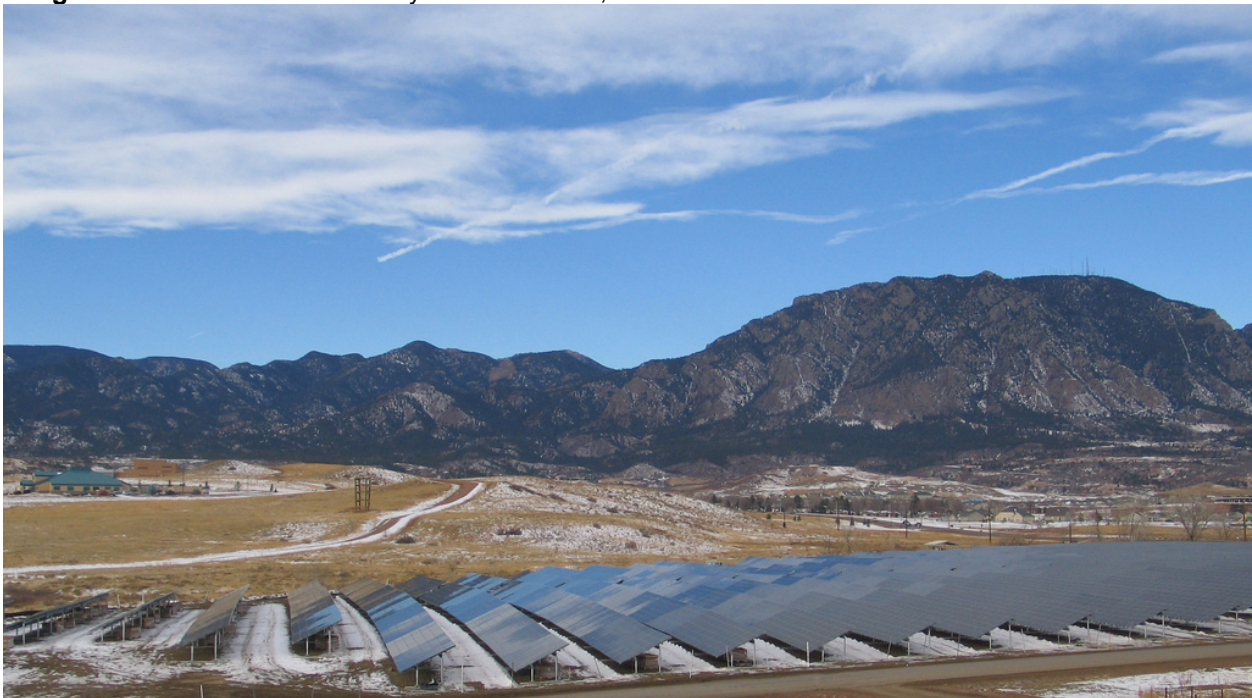
Figure 2. Fixed tilt PV solar array at Fort Carson, CO

Generally speaking, most large-scale solar developments have employed the use of PV systems. PV solar energy systems have a number of different attributes that are relevant to installations on landfill caps, including energy output ratings and weight characteristics of the different cell types and support components available. Both fixed tilt and single and double axis sun-tracking mounting structures are available for PV ground installations. Fixed tilt mounting structures consist of panels installed at a permanent angle that maximizes receipt of solar radiation throughout the year, based on the site's latitude ( Figure 1 and Figure 2 ).