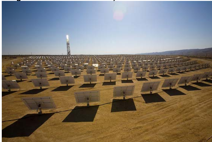
Figure 5. Power tower solar system in southern California