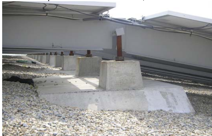
Figure 8. Pre-cast concrete footing used as foundation on side slope at Pennsauken Landfill, NJ