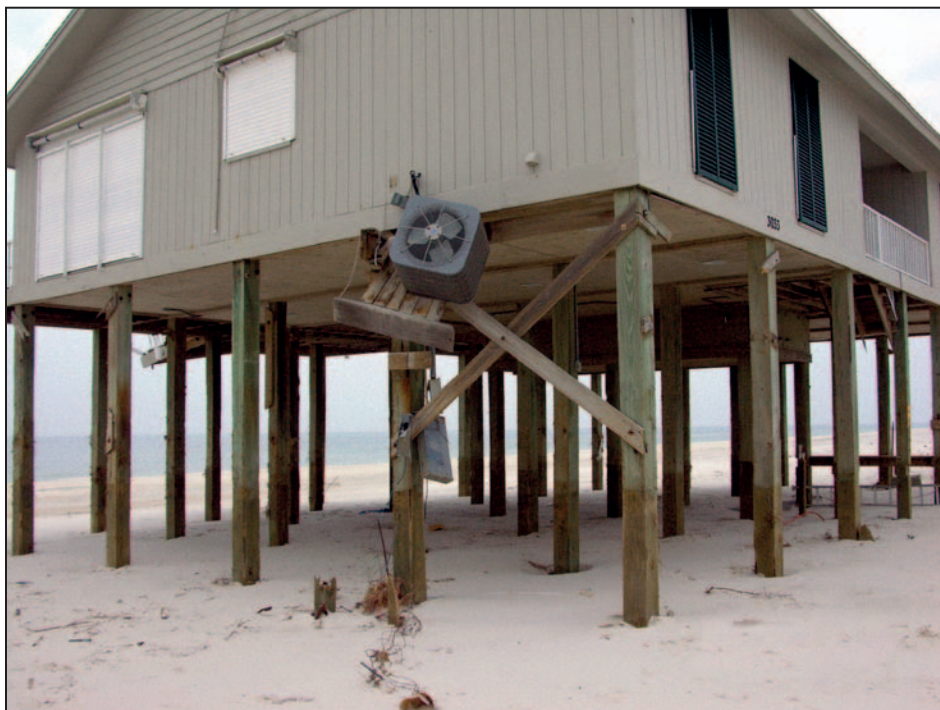
Figure 12-3. Small piles supporting a platform broken by floodborne debris

Although the 2012 IBC and 2012 IRC specify that flood damage-resistant materials be used below the BFE, in this Manual, flood damage-resistant materials are recommended below the DFE.