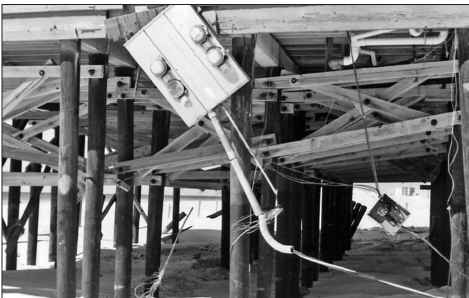
Figure 12-4. Electric service meters and feeders that were destroyed by floodwaters during Hurricane Opal (1995)

that produce 4 feet of flooding can cause water to enter the meter socket and disrupt the electric service. When a meter is below the flood level, electric service can be exposed to floodborne debris, wave action, and flood forces. Figure 12-5 shows an electric meter that is easily accessible by the utility company but is above the DFE.