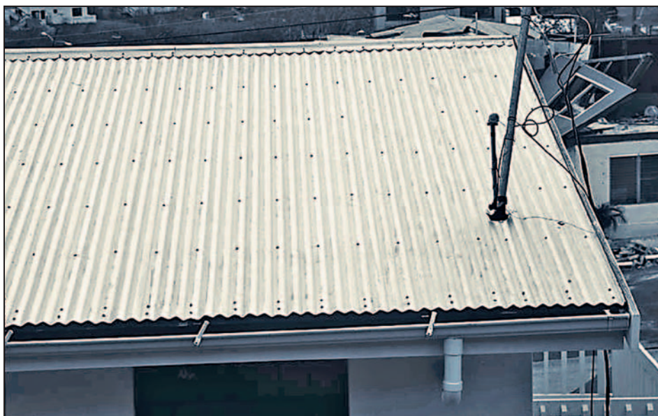
Figure 12-6. Damage caused by dropped overhead service, Hurricane Marilyn (U.S. Virgin Islands, 1995)