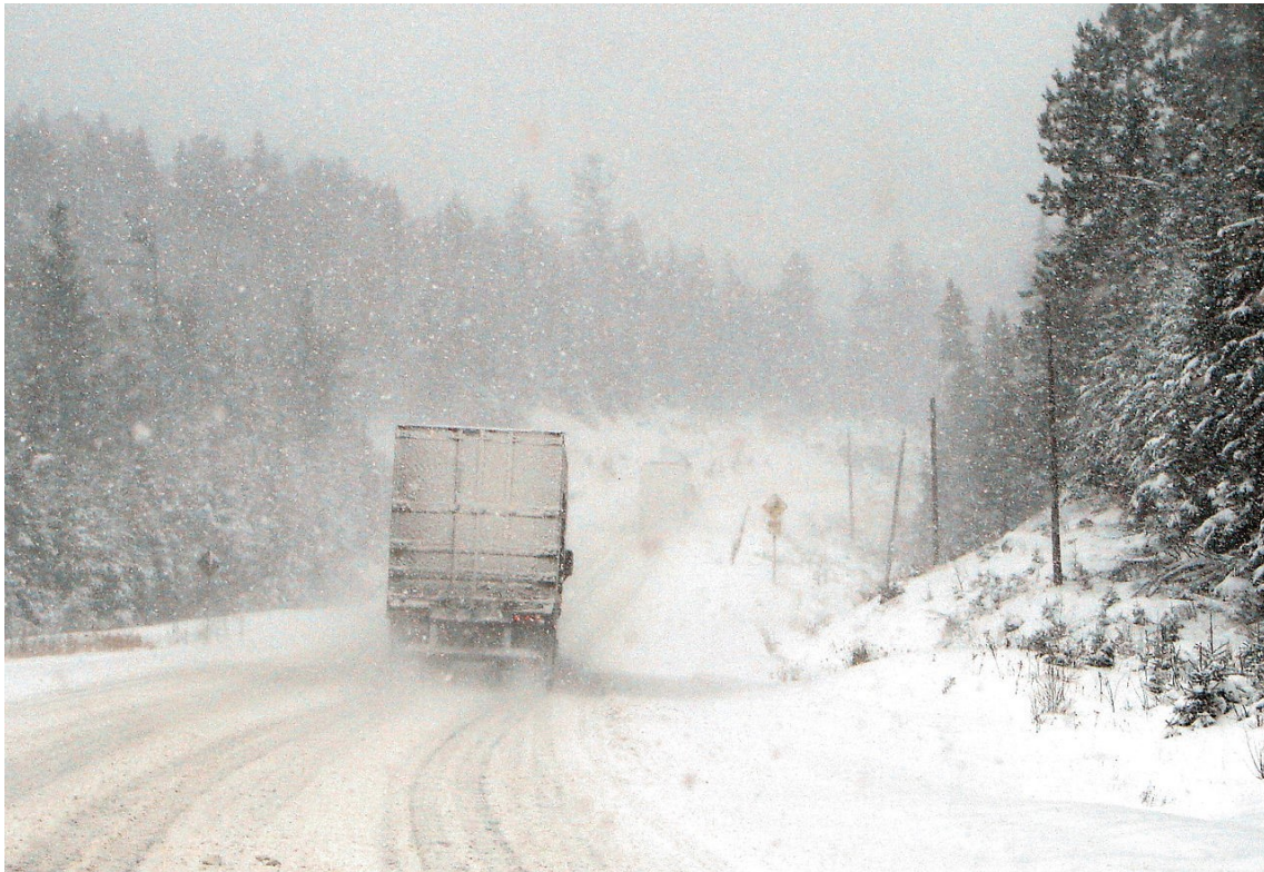
Figure 3. Small clouds of snow, ice, and slush thrown up by truck tires

Extreme weather conditions create several problems for sensors. Figure 3 illustrates one of them—the vulnerability of sensors to being obstructed by snow, ice, and slush thrown by other vehicles.