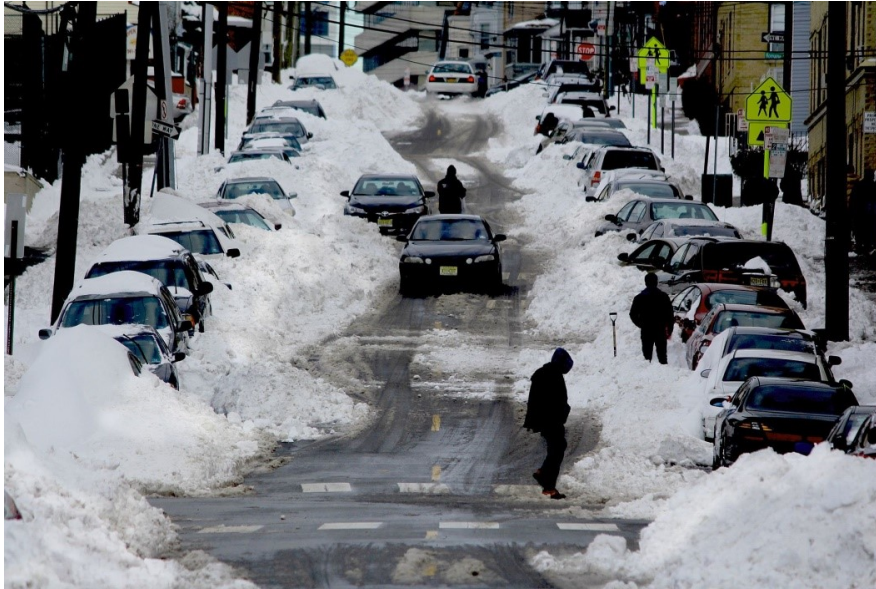
Figure 4. Shoveling out after a heavy snow

Cleaning the snow and ice from and around a car after a heavy winter overnight storm can take substantial time. Currently, Lyft and Uber avoid this problem because their drivers double as snow-removers, cleaning their own vehicles of snow and ice or keeping them in their own garage. But robotaxis will not have drivers, and thus a robotaxi company will have to keep a significant number of employees available at short notice for part-time snow removal work—after a snow or ice storm hits the area. This requirement will raise the cost of the robotaxi service in addition to being difficult for managers to administer.