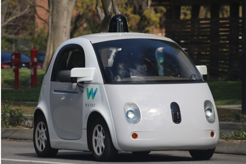
Figure 1. A self-driving car on the road in Mountain View, California