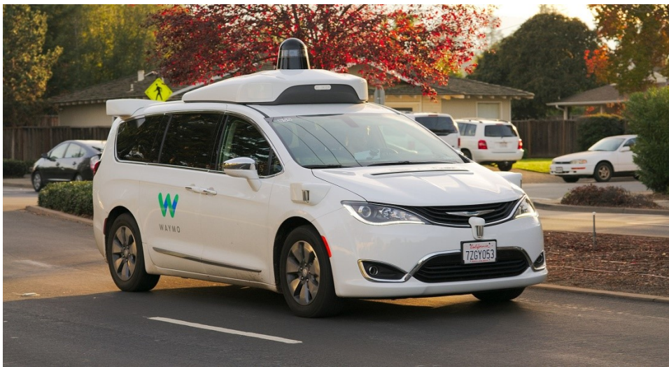
Figure 6. Waymo Chrysler Pacifica Hybrid minivan used as robotaxi in Chandler, Arizona.

Fleets of robotaxis and delivery vehicles are usually mentioned as the first applications of SDC technology to general-purpose driving. Ford is launching a fleet of pizza-delivery vehicles in Miami. Ford and GM plan to launch fleets of robotaxis in various cities, and Waymo already has [Figure 6].