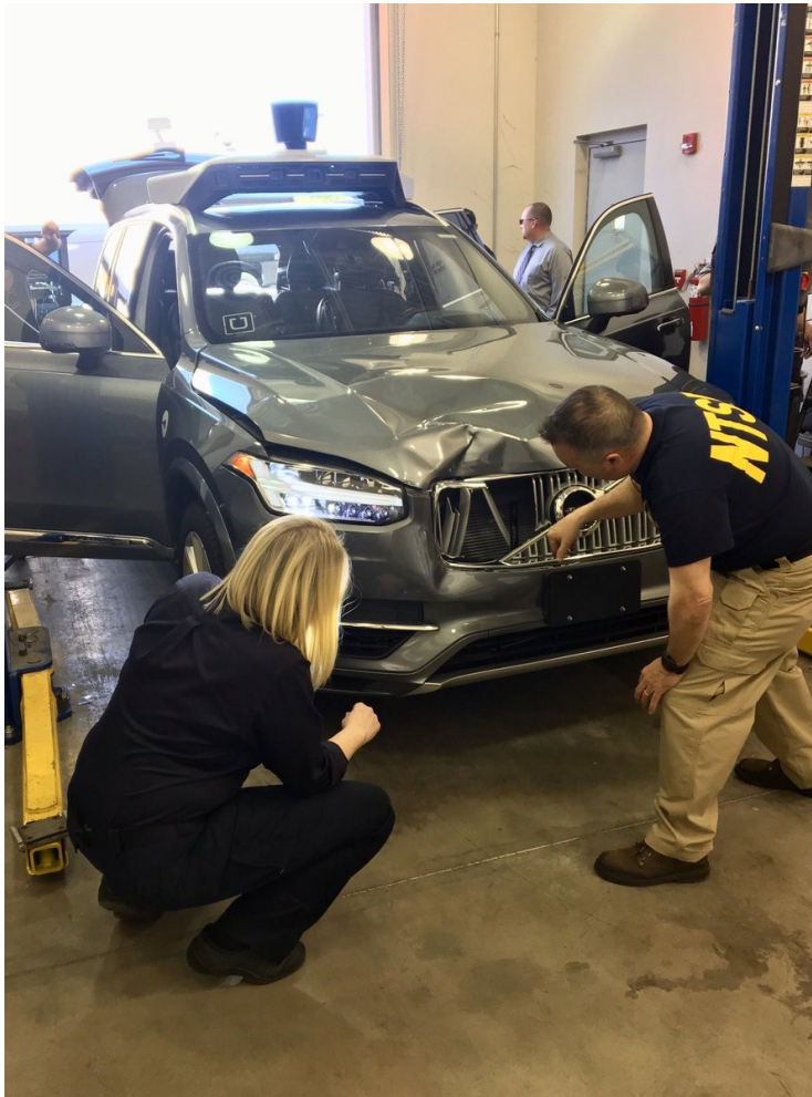
Figure 5. National Transportation Safety Board employees examine an Uber autonomous car involved in a fatal crash in Tempe, Arizona.

Illustrations of the political risk were common in the months following fatal SDC accidents involving Uber in Arizona and Tesla in California in 2018. See Figure 5. After these accidents, a US Senator wanted “to ensure semi-autonomous cars are also included in [an SDC-related] bill, that there are requirements for all of the vehicles to have a manual override and that there is more transparency with the data and safety evaluations” [50]. A Consumers Union specialist on SDCs, commenting on the bill, said, “We want to make sure that data is broadly shared to demonstrate their safety before the rest of us have to be guinea pigs sharing the road” [50].