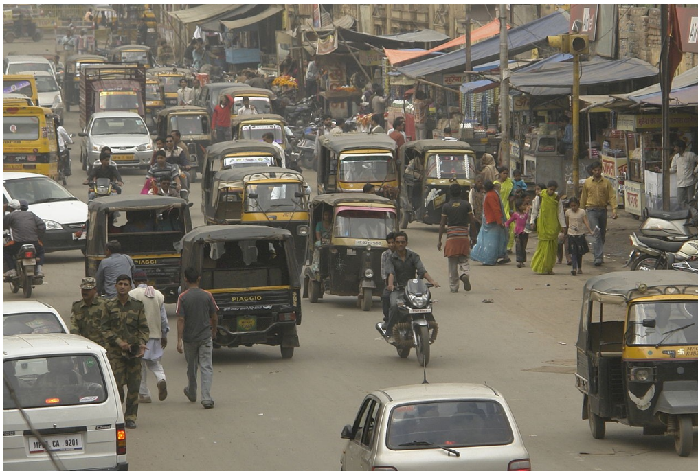
Figure 2. “People are able to use their commonsense understanding of the world ... to act sensibly in all sorts of new situations.” Yibiao Zhao.

Figure 2 shows a traffic environment where a traffic pattern may be difficult to identify and commonsense is essential.