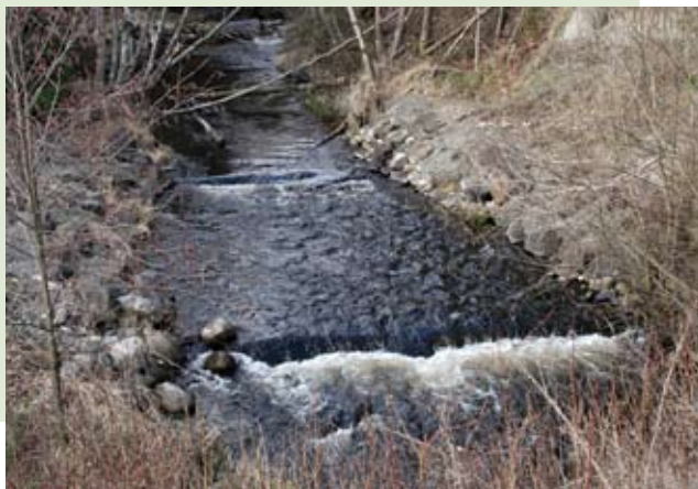
The restructured channel is now far easier for fish to traverse during migration.