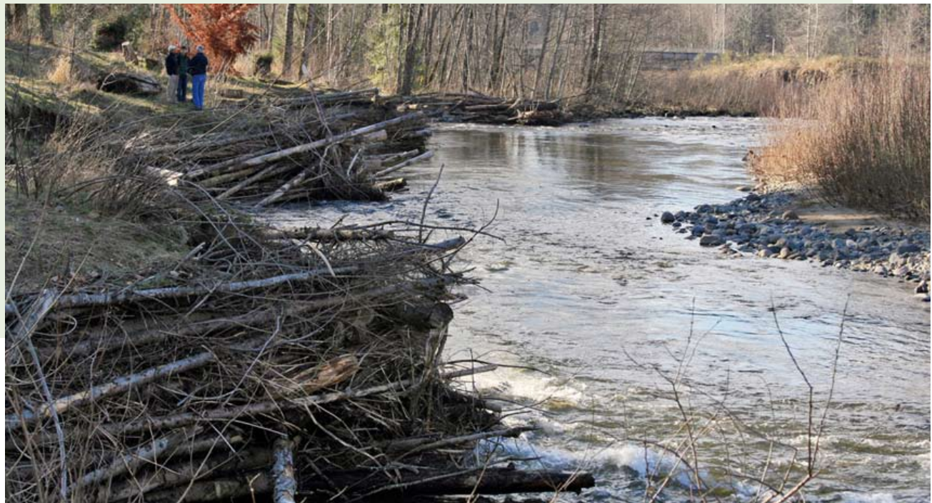
Four of the engineered logjams designed by Herrera Environmental Consultants on the Mashel River outside of Eatonville, WA.

On the Mashel River, just outside of the town of Eatonville, Washington, Smallwood Park contains a pond utilized by the town's residents for their annual fishing derby. Every few years the Mashel River is subject to flooding and the park, along with the pond, becomes inundated with floodwaters. The river embankment by this pond has begun to erode, and with each new flood event, the park, and the County road nearby, are potentially threatened with damage.