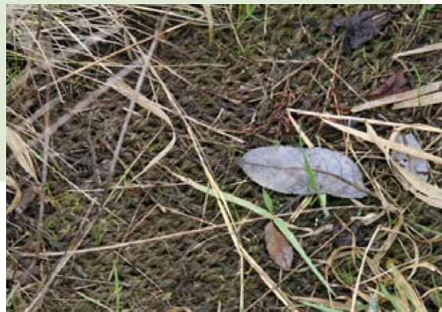
Coir fabric covers the upper bank.

Along the linear portions of the embankment, the county laid large limestone rock up to the ordinary high water mark. Seventy-five pieces of large woody debris were then placed along the project length with