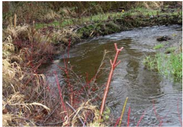
The added vegetation to the creek provides habitat and cover for fish.

"The reason that we are allowed to do this work is that Washington State Fish and Wildlife considers it an enhancement to the stream," said Geiger. "It simulates a heavily vegetated stream bank. Fish just love it. We've actually seen fish using it as we are installing it. They get right in there and use it for cover and so forth. It was pretty surprising."