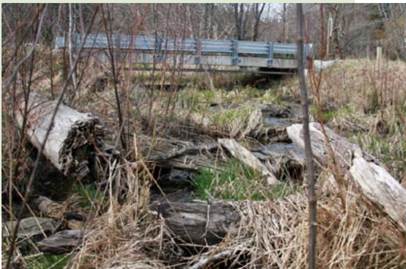
Wood positioned downstream of the bridge slows water flow and provides habitat for fish and other wildlife.

“When a large amount of water goes through a culvert, it acts as a fire hose, and it can cause a lot of impacts further downstream as well.” -Peter Bahls