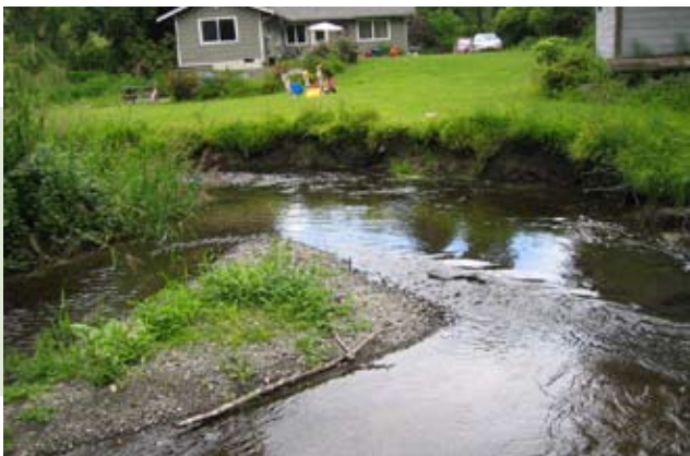
The eroding property prior to the start of the project.

"It was during a period when the Fish and Wildlife Department would normally not allow you to do any kind of work in this stream," said Geiger. "However, these types of structures can be installed with just about zero sedimentation. This qualified us for the streamlined Hydraulic Project Approval, which takes a much shorter time to permit, and eliminates the