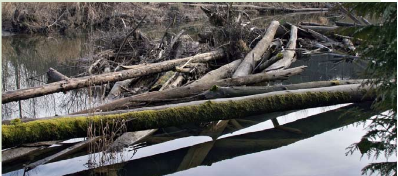
During flooding additional woody debris is recruited by the original logs.

In 1990, the Middle Green River created a whole new quarter mile meander bend in just over one day. In the process, the river demolished 150 feet of rock lined levee, a dozen maple trees and a couple acres of the Hamakami Strawberry farm. Historically on the Green River, rock riprap was used to prevent embankment scour. On such an alluvial floodplain as the Hamakami property, with an abundance of silt and sand, however, slumping is the primary cause of bank failure. Fine grained materials do not provide bank resistance, so in a high energy event, like the one that occurred at the Hamakami site in 1990, the Green River was able to move laterally at a very rapid pace.