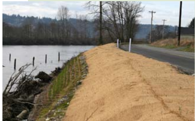
Eventually the coir fabric and the structural earth wall itself will be completely overgrown with hydro-seeded grass and other vegetation.

“Overall, this type of design will require less ongoing maintenance than riprap,” said Lucas. “It secures the riverbank against erosion, and it helps to meet our commitment towards maintaining salmon habitat, a stated goal of Snohomish County. When we can add those elements together and stabilize a County road in a habitat friendly manner, I think the project speaks for itself.”