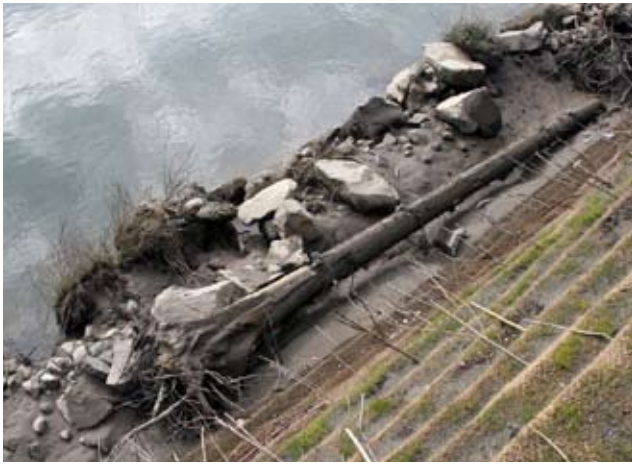
The willow cuttings planted throughout the embankment lend root cohesion and stability to the structural earth wall.

weighted down by layers of compacted gravel-borrow taken from a local quarry. The geo-grid is folded over, and another layer of gravel is used to weigh it down further. As each wrap is completed, the following one is offset by at least one foot, creating the step-like appearance. The outer face of the wall is covered with a layer of heavy coir fabric, and topsoil which is then hydro-seeded. This allows the geo-grid to lock in place and secure the embankment without threat of degradation from exposure to ultraviolet light. Finally, the entire embankment is planted with live willow cuttings which ultimately take root. As the trees grow, their root structures add to the stability of the embankment.