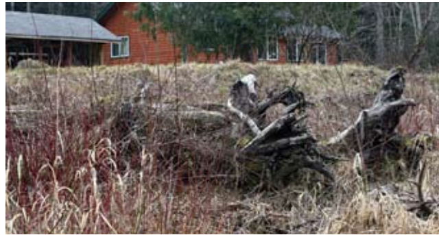
Downed trees claimed by the Forest Service provide the skeleton for the rock groin structure.

“The first step was to pull the dike back about 40 feet and make a little more room for the river to occupy,” said Al Latham, District Manager for the Jefferson County Conservation District. “They then installed three rock groins into the river along a 200-foot section of the Hiddendale riverbank, the outer edges of which were approximately at the edge of the prior levee’s location. Then the entire area was heavily planted with willows and other vegetation.”