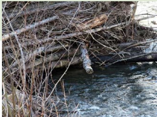
The pools established behind each jam provide much needed habitat and refuge for migrating fish.