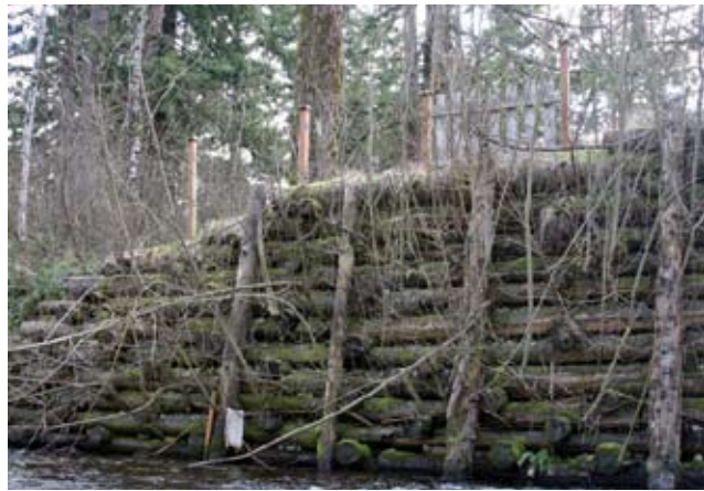
The crib wall will overgrow with vegetation, which will ultimately become the structure itself when the logs finally decay.

sun exposure. It took a lot longer to establish than the section that was shaded by the big trees and not facing direct sunlight. That section had perfect establishment straight away."