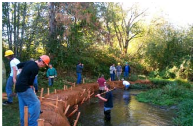
Construction of the brush mattress underway.