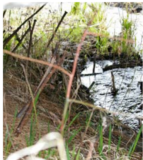
Coir matting and planted vegetation stabilize the creek banks under the bridge.