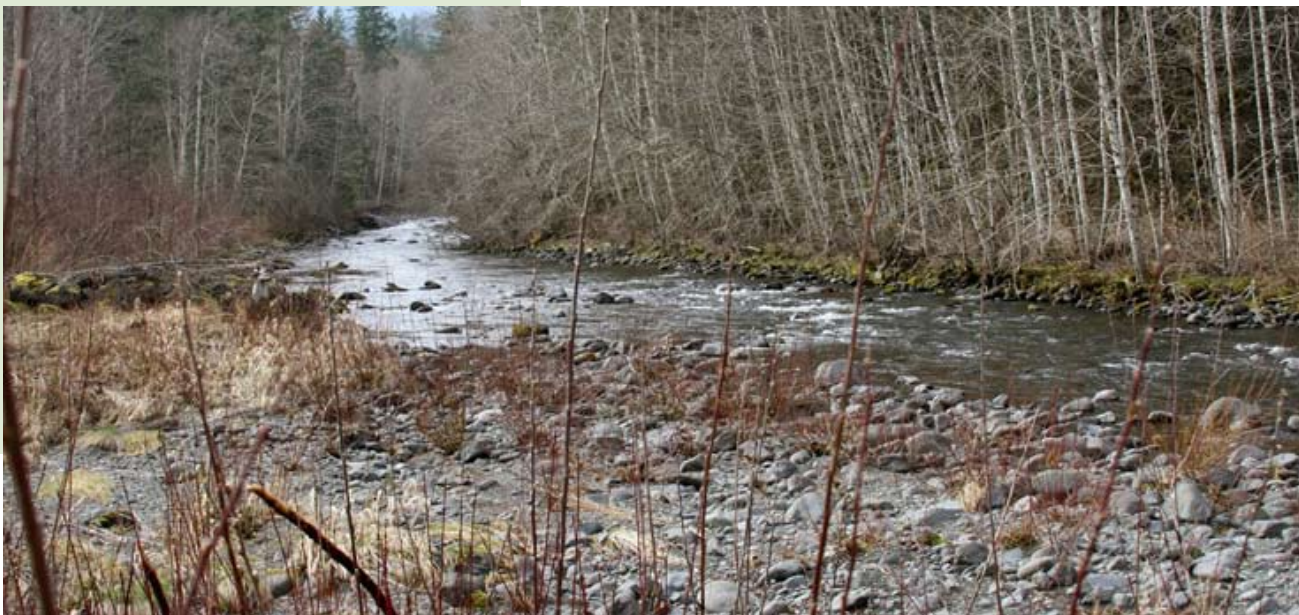
Planted willows, dogwoods, conifers and other trees will create a mat of roots to help stabilize the riverbank.

The first step in installing the groins involved temporarily blocking the river from entering the construction site. Since the project was undertaken while the river was at a seasonally reduced level, only a small area had to be coffered off with sandbags. Once the construction site was secured, three trenches extending 25 feet back into the bank were dug, and tapered down into the river channel. Multi-sized rocks similar to that used in riprap design were then carefully layered into the trenches.