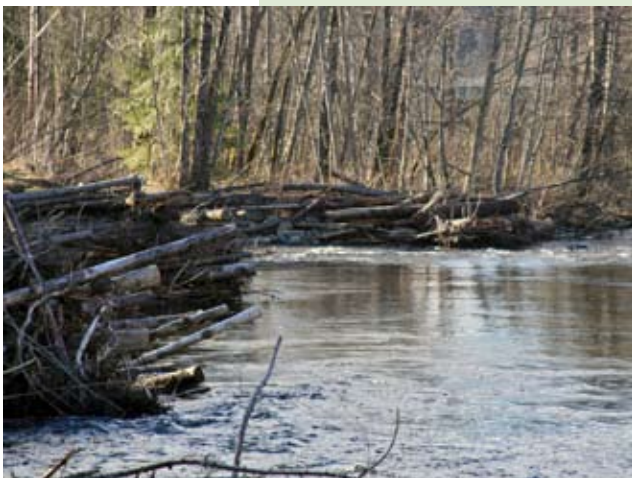
The complexity added by the logjams is important for slowing down water flow on the river.

“We needed to figure out what we could do to help fix the riverbank and change the flow characteristics of the river without accelerating flow through the reach.” - Ian Mostrenko