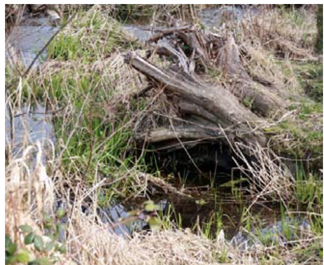
Many of the logs are actually buried in the banks.