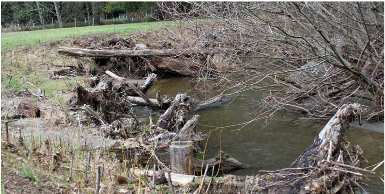
Wood added to the banks of Schneider Creek slows water flow and improves habitat diversity.