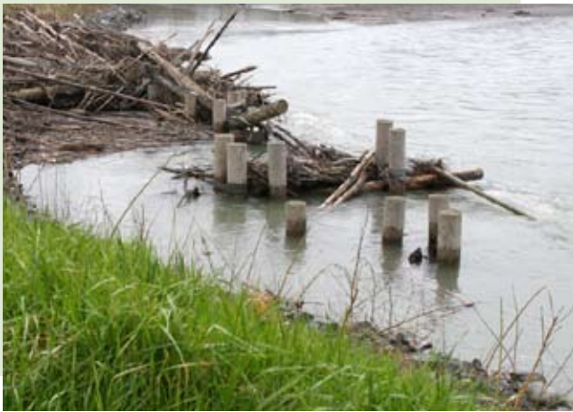
One of the scour holes being stabilized by the Overflow project. Woody debris has begun to collect and will be incorporated into the riverbank.

The Everson Overflow, located outside the town of Everson in Whatcom County, Washington, has wide-reaching affects during high water events. The overflow is a high ground divide situated between the Nooksack River Basin and the Fraser River Basin. During significant flood events at this site, water tends to overtop the right bank of the Nooksack River and spill into the Everson Overflow. It can then surge into the Johnson Creek floodplain, flowing north, and ultimately reaching the Fraser River Basin in British Columbia, Canada. In the aftermath of one such occurrence in 1990, the Trans-Canada highway was closed for several days and millions of dollars of damage occurred. To address this trans-boundary flooding issue, an international taskforce assembled consisting of a number of agencies and technical experts from both Canada and the U.S.