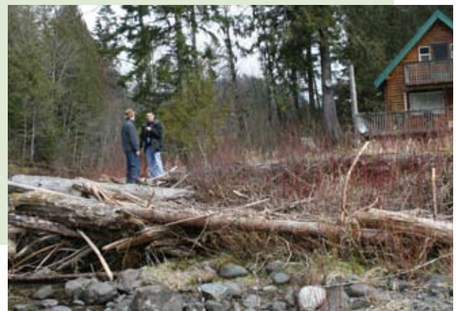
In the background stands one of the Hiddendale properties protected by the project.

“The typical approach before we did this would have been to line the banks with riprap, using the same size material we used in the groins,” said Latham. “The thing is, when you go that way, currents accelerate along riprap, and you’re just sending the problem downstream. You don’t get any improved habitat or channel diversity. It’s just a rock wall. With these three small groins, it didn’t establish a big footprint, but it’s really kept the thalweg, or the main part of the river, well out beyond the bank, preventing any further erosion. It also created all this habitat in between each groin. Now the bank has been stabilized as well or better than riprap ever could do it.”