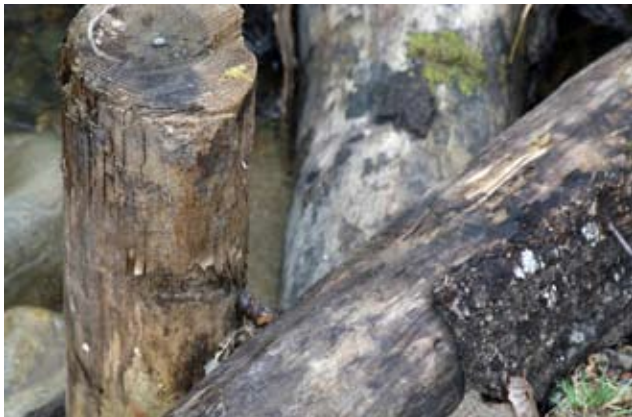
The logs in the jams are secured to each other with rebar.

“The whole site is a lot more ecologically functional for fish and wildlife habitat now, not to mention the banks being protected” said Kuttel. “When you use plant materials, it actually slows the water down. When you armor a bank, it is protected from erosion, but the energy is often redirected to the opposite bank downstream, causing damage to someone else’s property. Then the next landowner has to do it, and then the next, just to protect their property. When you use something like willow cuttings, the water just lays them down and the energy is dissipated instead of tearing the banks all apart.”