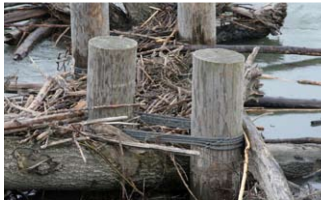
The timber piling structures capture woody debris, which provides roughness to the river, and ultimately establishes additional habitat.

“The lower main stem Nooksack is an important river for a number of species,” said Lee. “It is a migratory reach for Chinook and coho salmon, as well as steelhead trout. Bull trout, which are listed under the