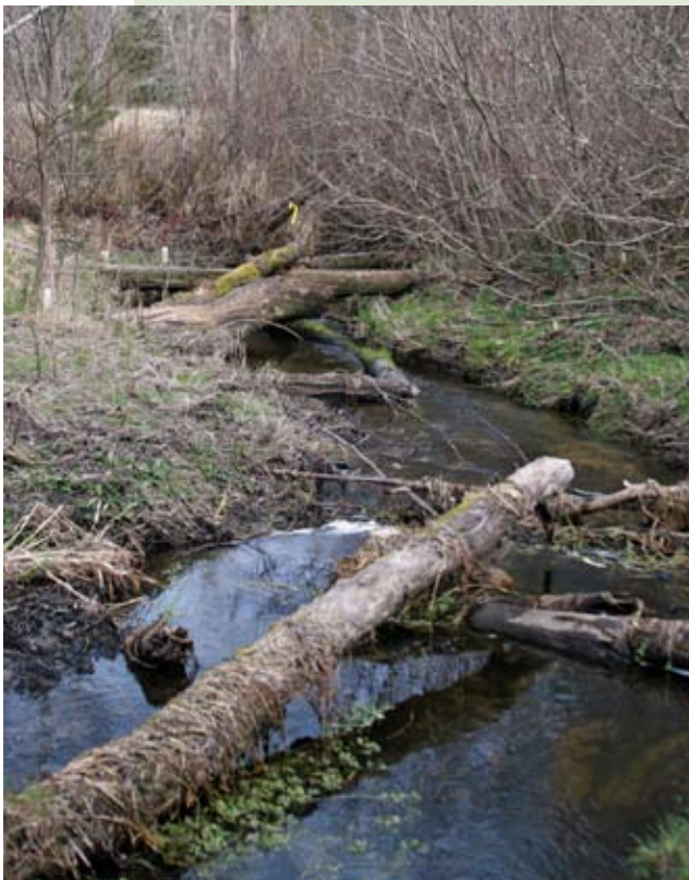
The entire area is protected as an ecological preserve.