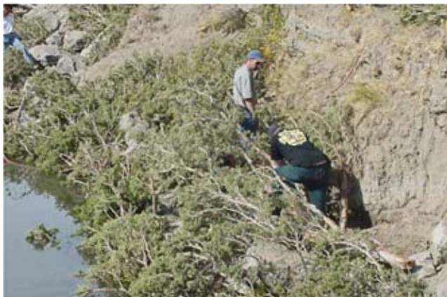
Figure TS14E-8 Boulders serve dual purpose: to stabilize the toe and secure brush revetment