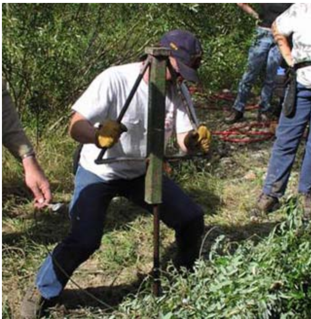
Figure TS14E-3 Post driver being used to install soil anchors