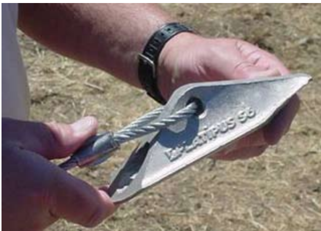
Figure TS14E-1 Platipus Stealth ® anchor